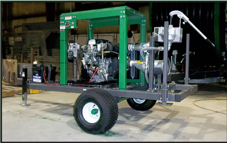
37HP Primary Pump with Trailer Option Pictured