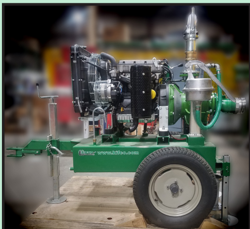
25HP Primary Pump Pictured